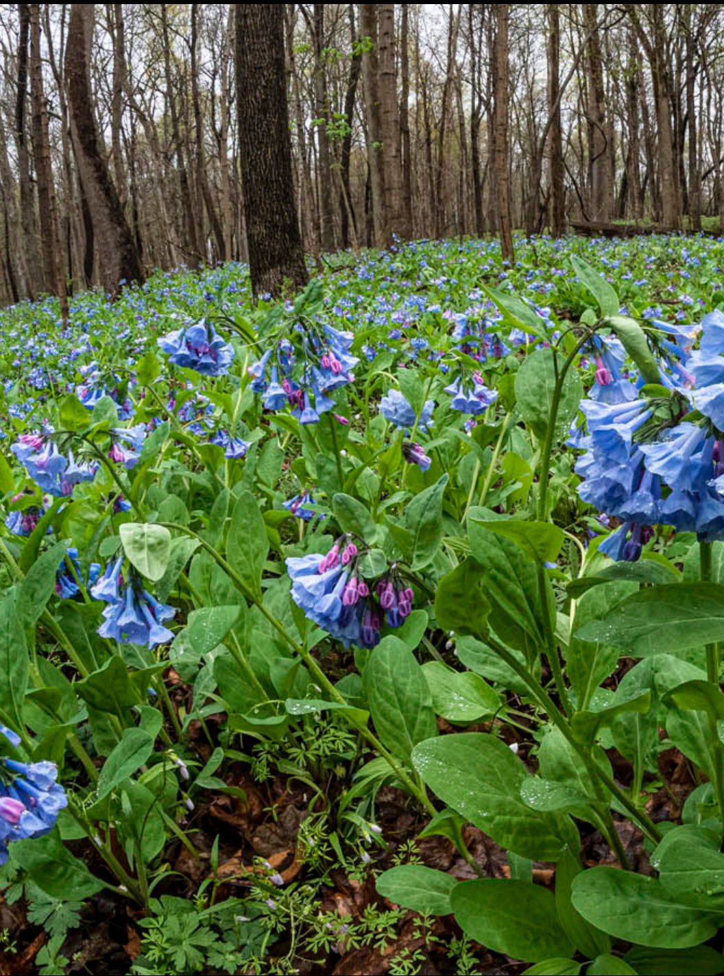
Virginia Bluebells at Williams Woods.