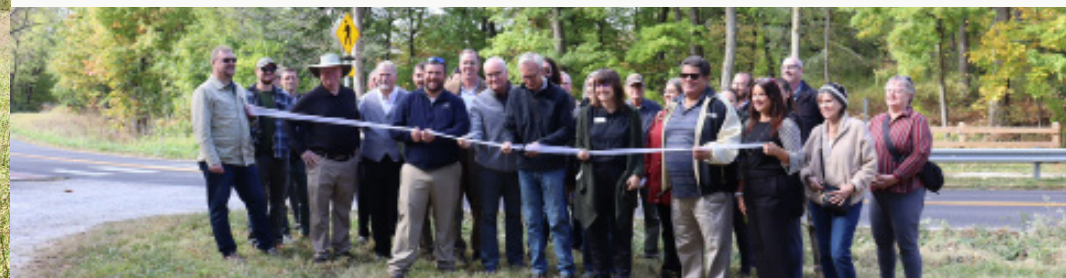
NICHES friends and supporters gather for a ribbon cutting ceremony at Clegg Memorial Garden.