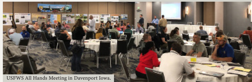
USFWS All Hands Meeting in Davenport Iowa.