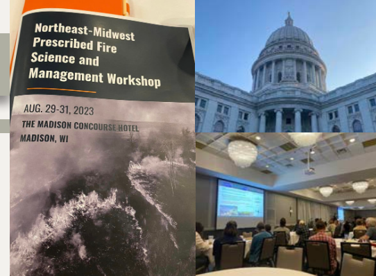
Scenes from the Northeast-Widwest Prescribed Fire and Management Workshop in Madison Wisconsin.