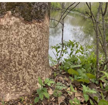
Beaver browse on Deer Creek

While pulling garlic mustard along the serene Deer Creek, I found myself following a beaver path through rue anemone, trillium, may apples, and wild ginger. The trees along the trail were marked by wounds from beaver teeth. I was excited to find their work and reflect on my surroundings, knowing the individual beavers will have positive impacts on the community over time. The water rushed over the creek bed rocks and birds were singing, many returning from their winter migration. The wind moved the tops of the trees not yet leafed out. There was a marked absence of vehicular traffic and other noise pollution. Feelings of calm, safety, and security washed over. It's understandable the beavers found this spot to call home.