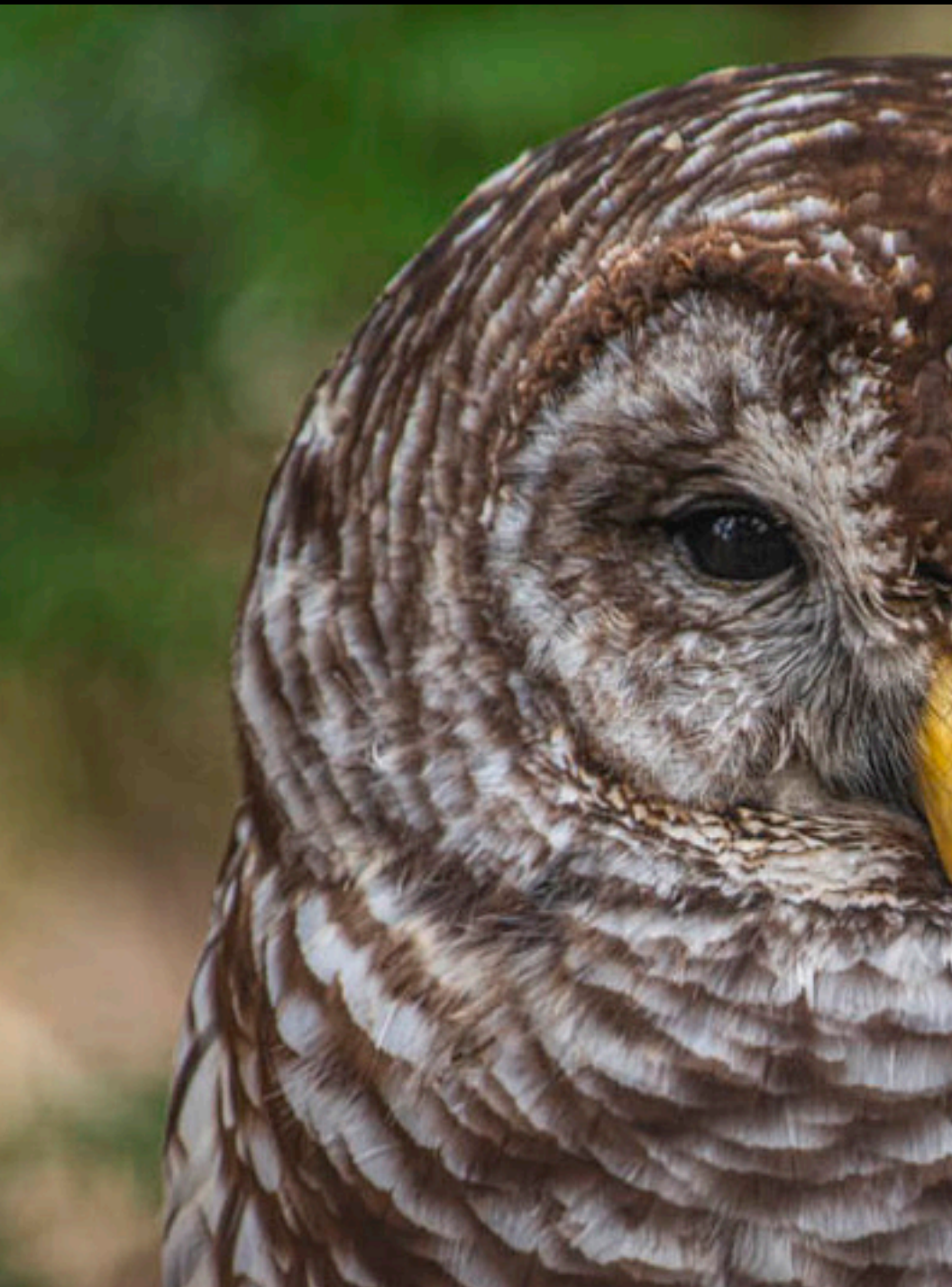
Barred Owl.