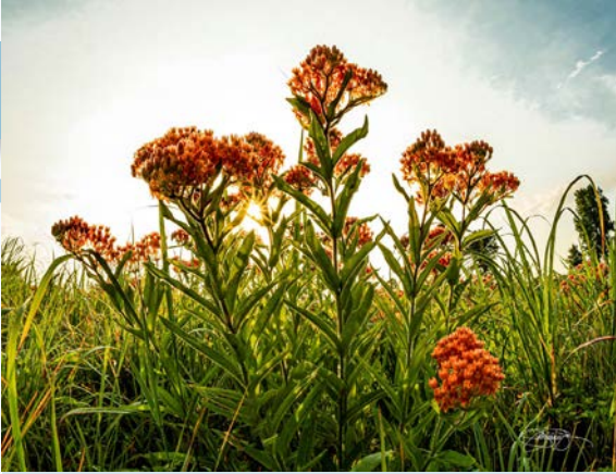
A population of butterfly weed blooming at our Holley Savanna Preserve.

preserves in the NIPSCO service area including Holley Savanna and Vacendak (Newton County), Sixbey and McAllister Woods along Wildcat Creek, Berkshire-Tarnowski along Deer Creek, Moyer-Gould Woods, and Frog's Glory (Carroll County), and elsewhere in Jasper, White and Howard counties. These 20 preserves represent a third of the total acreage that NICHES protects!