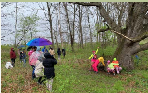
Greater Lafayette Dance Collective Members perform under Moyer Gould's iconic 'Great Oak'

On April 22 and 23 NICHES members, volunteers, and supporters gathered in Carroll County to celebrate Earth Day with our Annual Meeting and a series of nature themed activities. The weekend began with a volunteer effort to combat invasive species at our Moyer Gould Preserve. In between garlic mustard pulls, volunteers were treated to an outdoor performance by the Greater Lafayette Dance Collective.