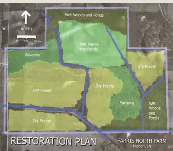
The Farris Estate Restoration Plan recorded in Lois Farris's will in 2005. NICHES plans to use this document as the foundation for a more detailed long-term stewardship project.

NICHES staff and board efforts to set a new bar for restoration work with this opportunity. We are working with-up spraying of invasive shrub thickets and invasive forage grasses. The remnant areas retain significant populations