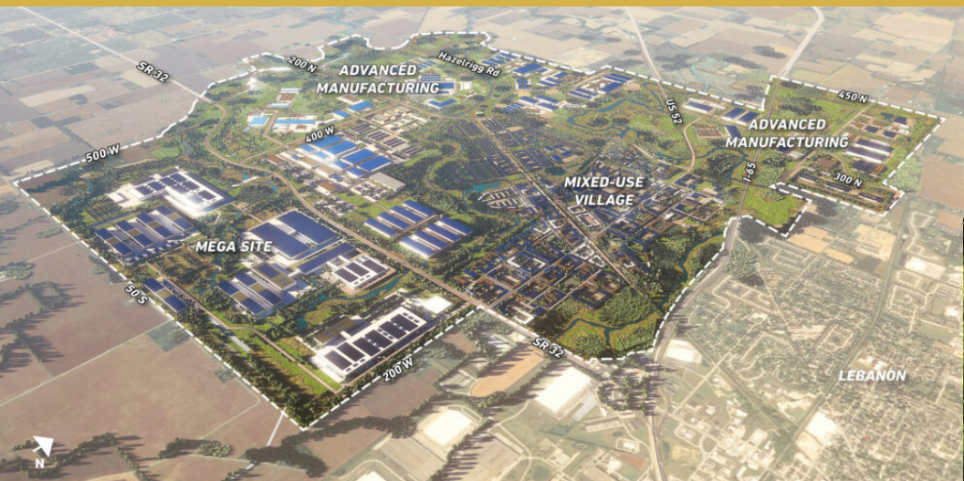
A birds eye conceptual rendering of the LEAP Lebanon innovation district. The IEDC claims that 9,000+ acres are already ready to parcel for manufacturing, R&D facilities, or corporate campuses.

One of the natural resource concerns associated with the LEAP project revolves around its water supply. IEDC intends to draw water from collection wells located on property along the Wabash River near Goose Island in Tippecanoe County and transport it via a 35-mile pipeline to Lebanon. Lafayette Mayor Tony Roswarski notes that 17 mgd (million gallons per day) is the most the city pumps on the hottest summer day.