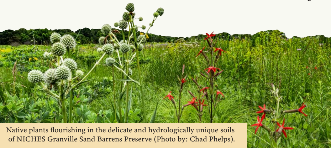
Native plants flourishing in the delicate and hydrologically unique soils of NICHES Granville Sand Barrens Preserve (Photo by: Chad Phelps).

-NICHES LEAP Pipeline Subcommittee niches@nicheslandtrust.org