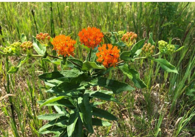
Butterfly weed blooming at NICHES recently acquired Farris North Farm preserve in White County.

We experienced alarming change out of our control this summer as huge portions of North America faced highly unhealthy air quality from the smoke of massive wildfires in Canada. These wildfires are a symptom of great disruptions to habitats, land management, and the climate. We adapted our summer camp plans to keep the children safe while still engaging with Nature in a meaningful way. The impactful work of NICHES gave us the fresh air of hope. Protecting, Restoring, and Sustaining local natural areas is the most effective way we can help the Earth, support resilience, and mitigate the harmful effects of the changing climate.