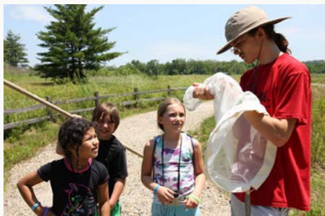
Catching pollinators at Un-Plugged Nature Camp (Circa 2012)

In addition to being NICHES largest camp ever, this year's program marked another milestone for me personally: my 10th year of running camps! From 2012 to 2014, while I was in high school, I founded a nature camp program in southeastern Indiana called "Un-Plugged Nature Camp." The goal of this camp was to share experiences that I had in my own childhood growing up with a naturalist mother, to get kids out in the woods and off their recently popularized iPhones, and to help save up money to buy my first car. It was this experience that opened my eyes to the world of natural education, and I knew then it was something I wanted to pursue in my career beyond high school.