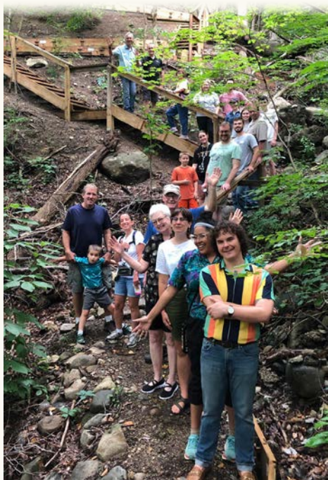
NICHES 27th Birthday Event attendees posing for a photo on our new Duke Energy Upland Trail at Clegg Memorial Garden.

On September 17, we hosted our Black Rock Society Dinner at the Wells Cultural Center in Lafayette. Members of our Black Rock Society have donated land, included NICHES in their estate plan, or given a sizeable gift annually or over their lifetime. It was a joyous occasion for all. Staff and Board members shared reports on NICHES ongoing while we shared a delicious meal catered by Juniper Spoon. It was personally meaningful for me to meet more NICHES members that have profoundly influenced our organization and contributed